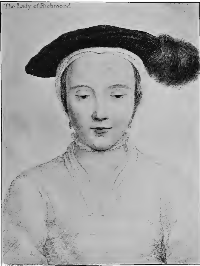
THE DUCHESS OF RICHMOND